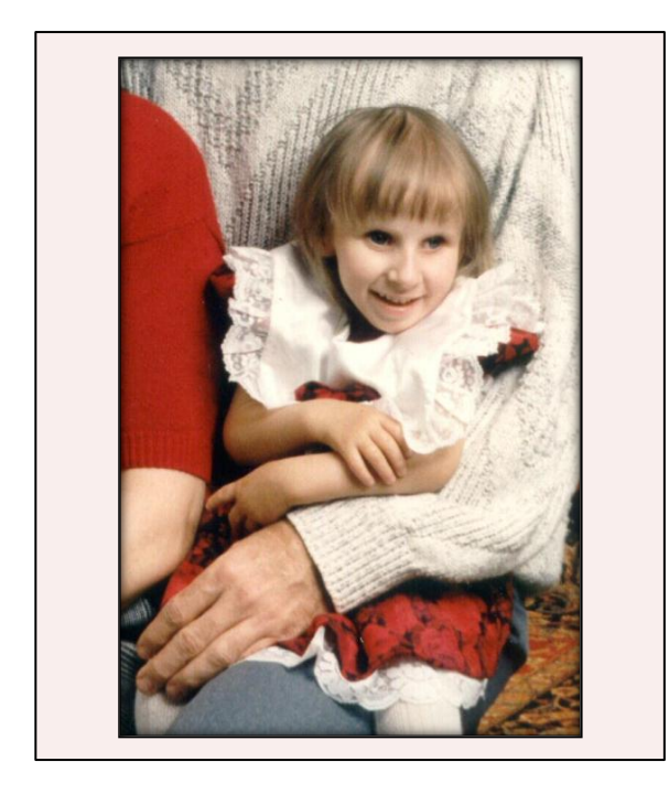
Figure 1. Patient 1 (here, 5 years, 11 months), severe/borderline moderate. "She was a living example of unconditional love who touched everyone she met."

SEVERE CS. Children in this group have the shortest life expectancy (5.0 years) and are the smallest of all people with CS. The most severely affected survey subjects were the size of a six-month-old infant at age 3 years or older, could not sit up, and could not speak. The less severely affected members of this group were larger (up to the size of an average 18 month–2 year old child at age \sim 6–7 years) and were more communicative in that could sign or say a few words. Many in this latter subgroup could cruise on furniture or use a reverse walker. All children in this group were described by parents/doctors or observed by the author as happy and outgoing (Figure 1).