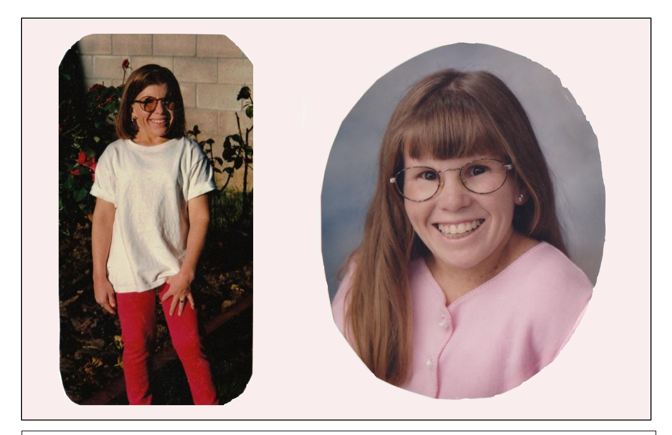
Figure 2. Patient 2, very mild. Left: 18 years. Right: 21 years. This individual was never cachectic and inadequate food intake was never a problem for her. Tooth extraction and braces reduced malocclusion. "She loved to swim, ride bikes, take walks, and shop. She would tell everyone, 'I was born to shop'."

MILD CS. Children and adults with mild CS share many traits with other CS patients, including very short stature, developmental disabilities, hearing loss, vision problems, and sun sensitivity (Figure 2). However, the skills attained and average age at death (30.6 years) in mild CS are significantly increased over other groups. As a result, many in this group are not suspected of having CS until adulthood and/or after they have visited many physician specialists — if they are diagnosed at all.<sup>19, 79</sup> The literature describes mild CS/CS in adults as atypical or rare, <sup>1, 14, 18,</sup> <sup>19, 37</sup> yet the even distribution of severity group membership among survey subjects here (Table 1) implies that mild CS may be underdiagnosed.